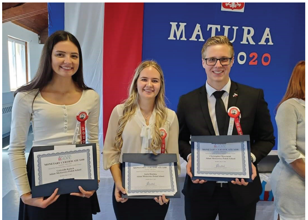
High-school graduates from Adam Mickiewicz Polish Supplementary School in Burbank, IL with their awards