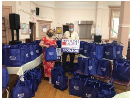
PSFCU sponsored food parcels for seniors

In June, we continued to provide assistance to people particularly affected by the COVID-19 pandemic. Benefiting from the support of the PSFCU Special Relief Fund, volunteers of Polish Filmmakers NYC carried out the third round of food deliveries. This time, with the assistance of priests from the parish of St. Stanislaus Kostka, food parcels went to Polish seniors residing at the Pete McGuinness Senior Center in New York's